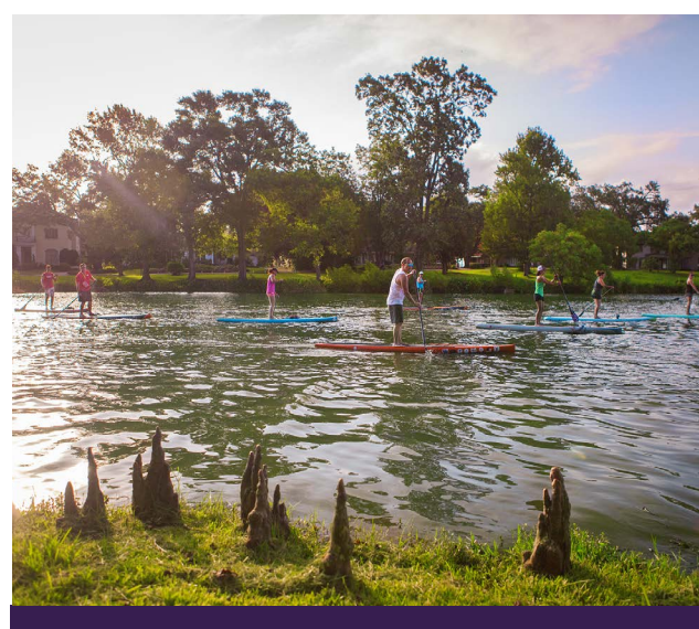
Louisiana's wildlife and nature is unrivaled in beauty.