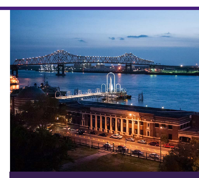
Downtown Baton Rouge has numerous leisure, culinary, and cultural activities in which to participate.