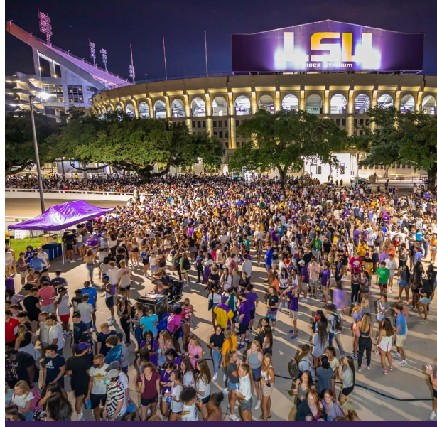
After hours and weekend work is part of showing up for students where they are, like this Welcome Week block party hosted by RHA.