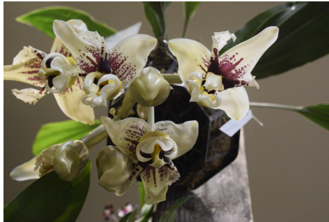
This multi-award-winning orchid only blooms for three days out of the year.