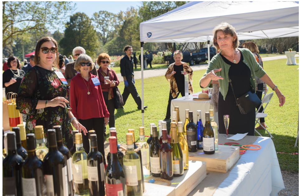
Guests taking a chance to win a bottle at the wine toss.