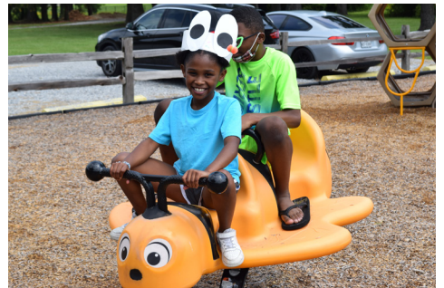
Children play on bee Pollinator Playground after a bug-themed StoryTime in the Garden with the Junior League of Baton Rouge.