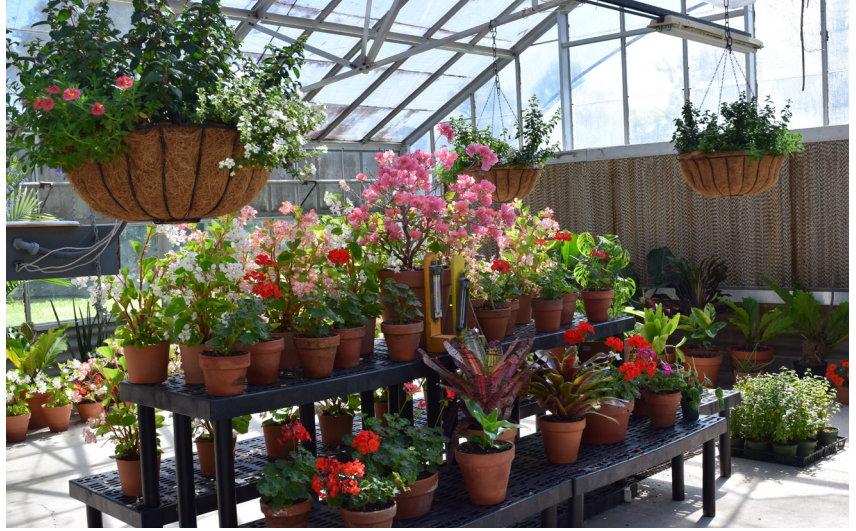
A view inside of the glass house.

The glass house is open daily from 8 a.m. to 4:30 p.m. During your next visit to the gardens, be sure to stop in and admire the collection.