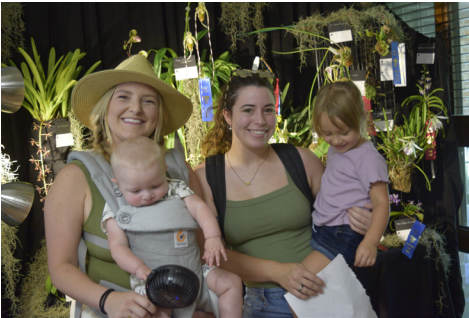
These young mothers had a great time checking out the orchid displays!