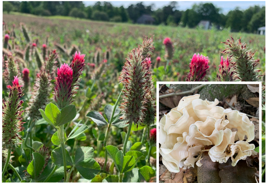
Above: Crimson clover , Right: Eastern cauliflower mushroom

At first glance, Baton Rouge doesn't seem like a haven for wildlife. However, the results from this year's City Nature Challenge offer strong evidence to the contrary. Every year, ordinary citizens come together to take part in the City Nature Challenge, a weekend-long global competition to see which city can find and document the most wild flora and fauna using a smartphone app called iNaturalist. Out of 445 global participating groups, Burden Museum & Gardens ranked in the top 6% for the number of observations made. Overall, 15,100 observations of more than 2,400 species were identified by almost 400 local participants, many of whom are members of the Louisiana Master Naturalists of Greater Baton Rouge. We are so thankful to everyone who participated. With your help, Burden Museum & Gardens ranked ninth in the United States for the highest species count and 30th for the highest number of participants. Again, thank you to the citizens of Baton Rouge for your enthusiasm and dedication!