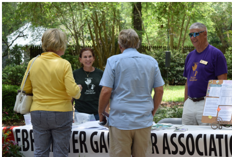
EBR Master Gardener Plant Health Clinic in Windrush Gardens.