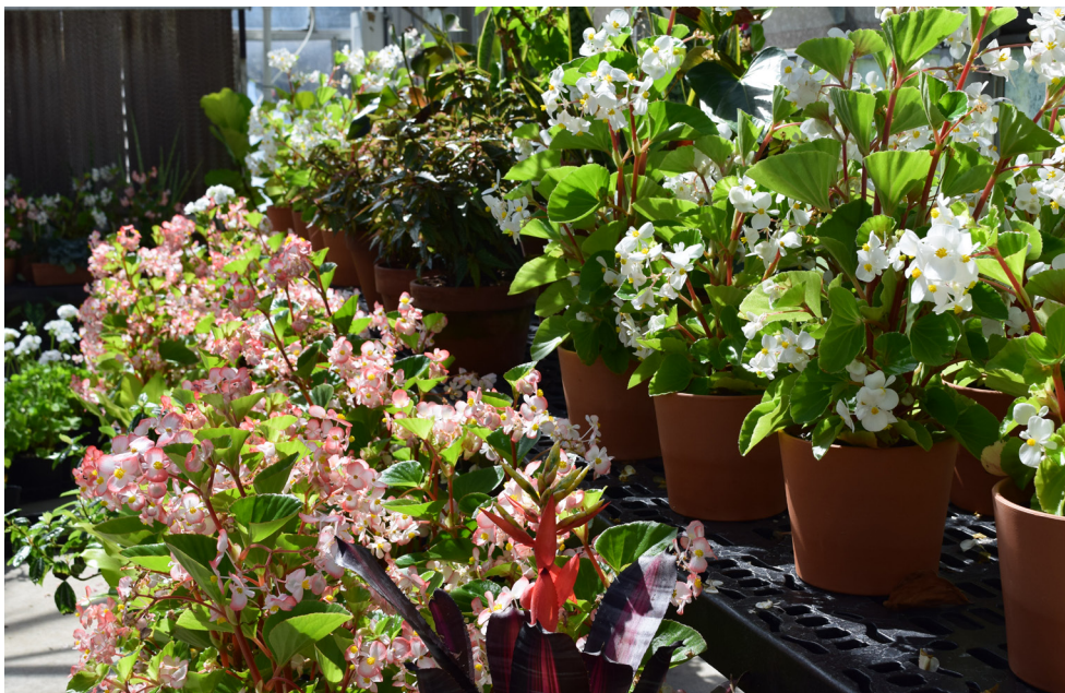
Bougainvillea blooms in the glass house.