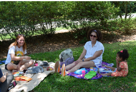
Family enjoys picnic in Windrush Gardens.