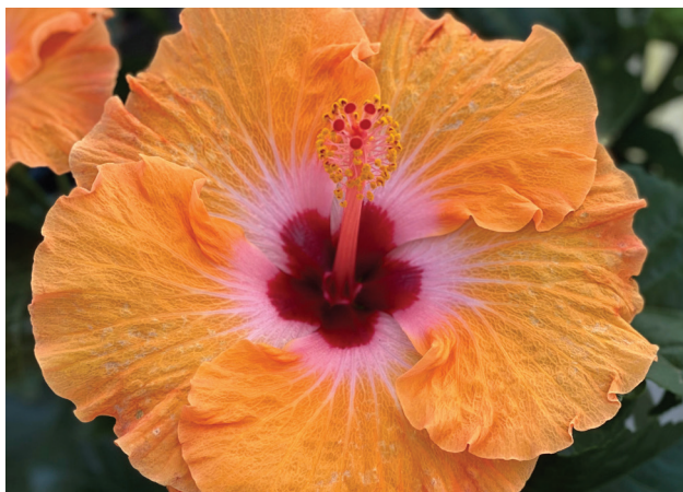
Tropical hibiscus comes in single- and double-flower forms in nearly any color combination imaginable.

Firecracker plant ( Russelia equisetiformis ) is an evergreen shrub with red and yellow