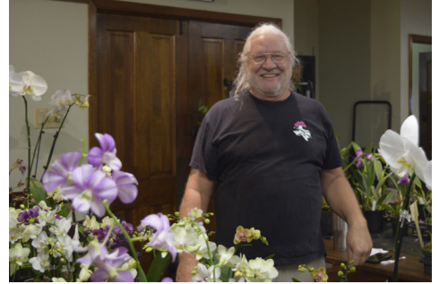
Spring Orchids was just one of our four vendor booths at the Orchid Show & Sale.