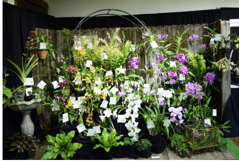
Baton Rouge Orchid Society took first place with this breathtaking display.