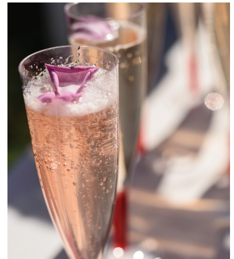
Event signature cocktail: The Rambling Rose.

Please join us to enjoy fall in the gardens with food and beverages, live music and entertainment. Purchase your tickets today for the Wine and Roses Rambler 2022 to be held on Sunday, Nov. 13 from noon to 2 p.m. Nonmember tickets are $100, and member tickets are $90. The proceeds will support the wonderful education programs and activities of the Botanic Gardens at Burden.