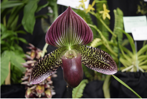
A Fred's Triumph Orchid.