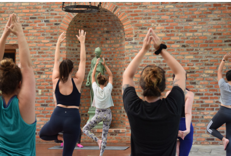
Yoga class led by PilatesPlus BR in the Orangerie.