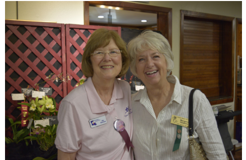
We are so grateful to ALL the volunteers and Orchid Society members who made this event happen!