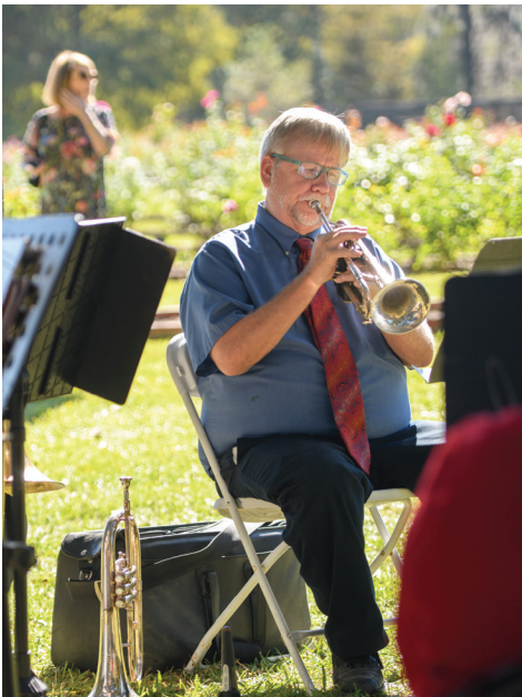
The Civic Orchestra of Baton Rouge playing near the Rose Garden.