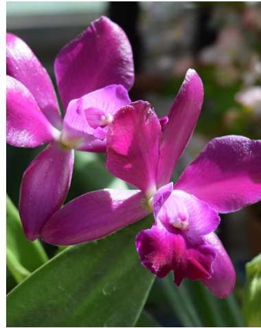
A Cattleya orchid shines in the light.