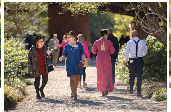
Top: Guests wander through the Rose Garden. Right: Guests ramble to and from the Pavilion.