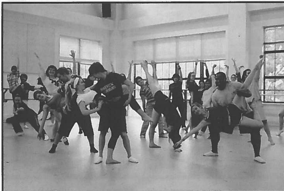
Bottom: Musical Theatre class members practice for upcoming spring performances.